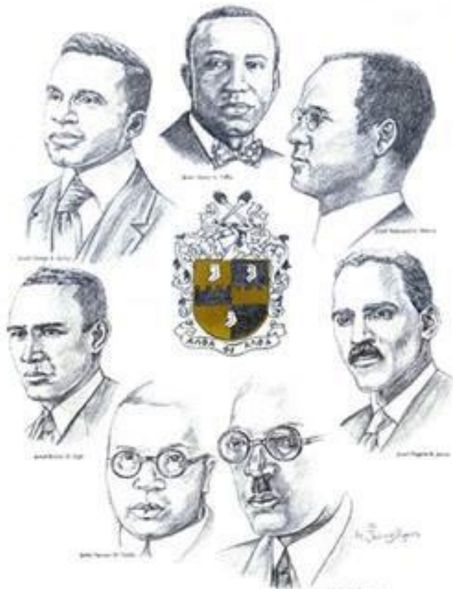
The Seven Jewels of Alpha Phi Alpha Fraternity